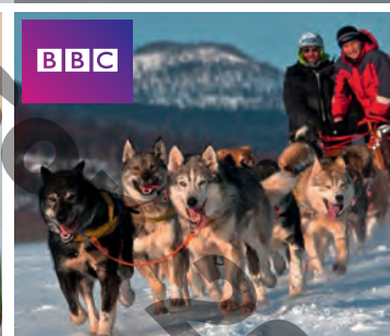
GREAT EXPERIENCES p16