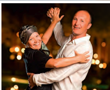
TRY SOMETHING NEW p11