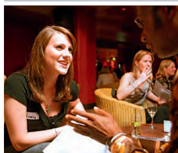
TIME FOR A CHAT p8